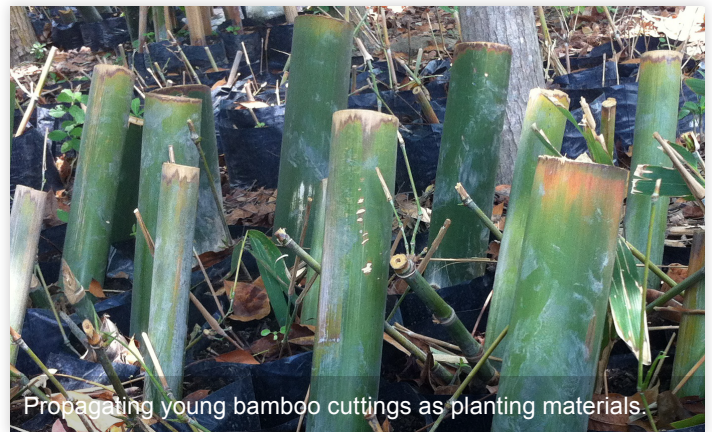
Propagating young bamboo cuttings as planting materials.

Evaluate programs. SAC-GP will use the PPI to evaluate the appropriateness of various organic and eco-friendly crops for poor farmers, starting with bamboo. Bamboo is considered more environmentally friendly than other forest trees because it is resilient, grows fast, and can be quickly harvested. SAC-GP sees increasing demand for bamboo in the Philippines as traditional lumber becomes scarce, specifically for flooring, laminated furniture, and construction material. Under this new program, SAC-GP supports farmers to propagate and cultivate bamboo trees through an “engineered bamboo” technology.