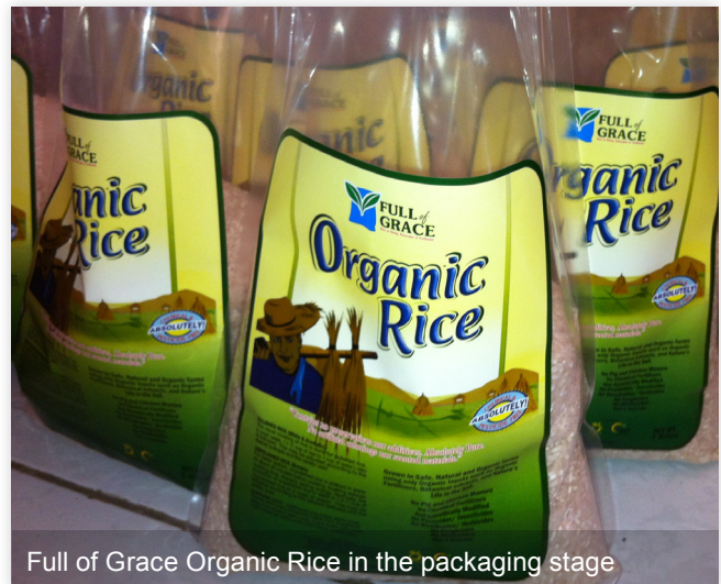
Full of Grace Organic Rice in the packaging stage

SAC-GP's commitment to organic agriculture is built on the belief that organic farming can reverse environmental destruction by using natural and organic materials in farming. SAC-GP also supports a farming system where farmers are less indebted to big business entities and are able to keep food for themselves, and therefore benefit from greater food security. Its services in this area include technical support such as training and knowledge sharing, production support and financial assistance. SAC-GP, together with the federation, carries the