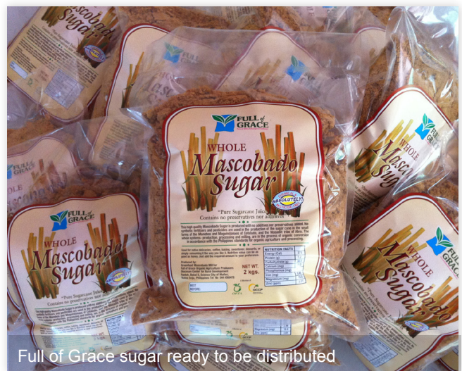
Full of Grace sugar ready to be distributed

Full of Grace brand, which has a number of organic agricultural products (e.g., rice and sugar) and by-products (e.g., jams, jellies) produced by organic agriculture producers who are also members of the federation's network of organic producers. Various service centers, such as the Central Consumer Center and the Central Marketing Center, were also established to provide support in packaging, marketing and selling the Full of Grace products.